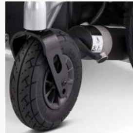
Castor wheels with aluminium rim