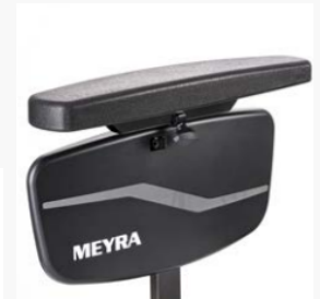
Standard side panel