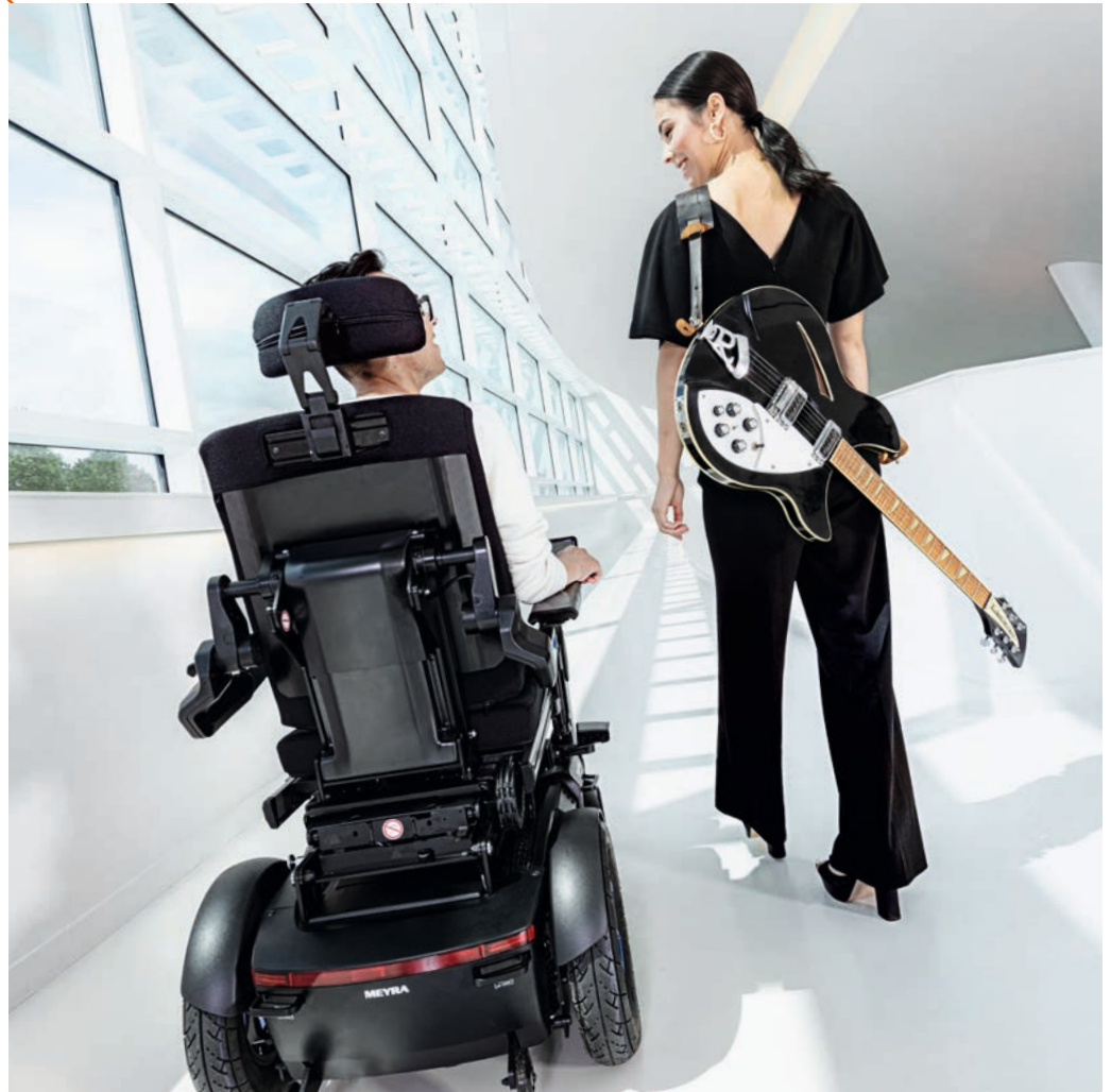
Stylish, modern design with matt black full panelling