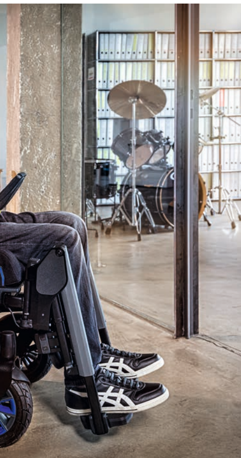
With all-wheel suspension and electric castor wheel lock (currently under development).