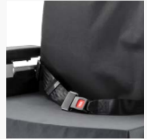
Reinforced seat belt