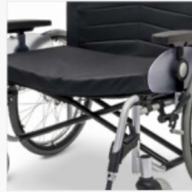
Increased stability through the use of a double shear